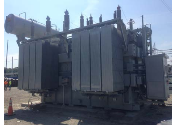
Figure 1 Schematic Diagram of a Power/Distribution Transformer